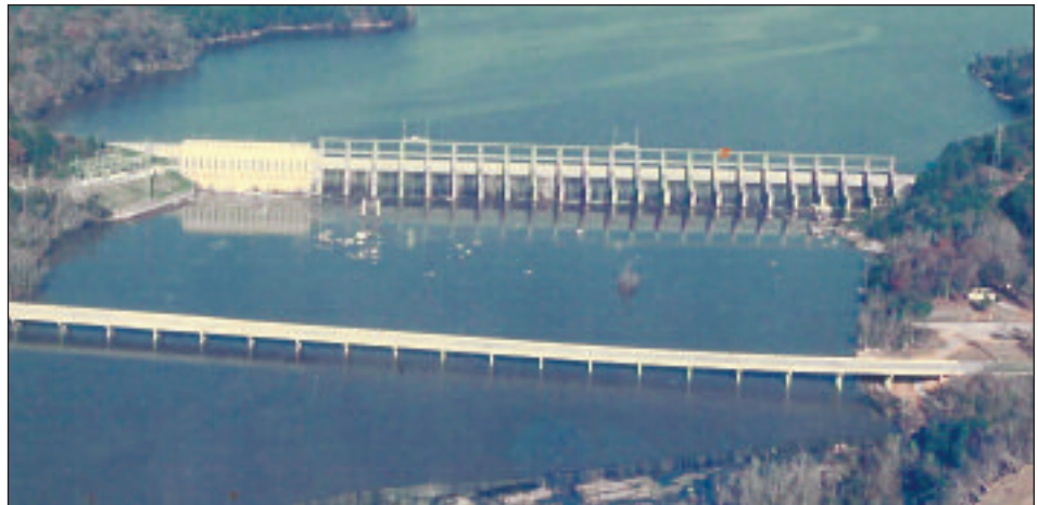
Fishing Creek Hydroelectric Station

The second modification is the construction of four anchored concrete buttresses in the river below the powerhouse to secure the structure to the foundation, or bedrock (see figures 3 and 4).