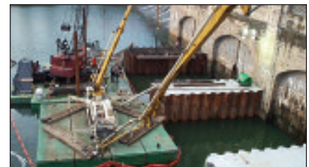
Figure 4: Construction of Concrete Buttresses Below Wylie Powerhouse, December 2002.