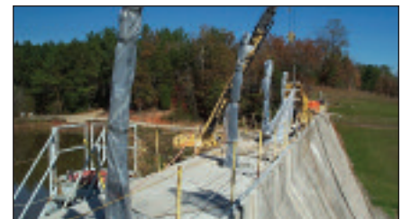
Figure 2: Installing Anchors in 99 Islands Bulkhead, November 2004.